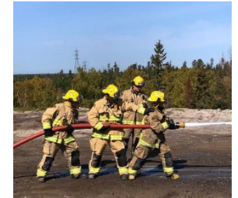
5 Group Training

To ensure that all members of the fire department are prepared to deliver the best level of services required, training standards have been developed to provide each member with the needed skills, knowledge, and abilities necessary to deliver fire and emergency services to the citizens of the municipality.