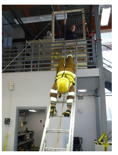
2 Ladder Training