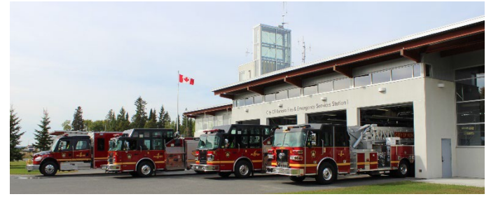
1 Fire Station One and Fire Fleet