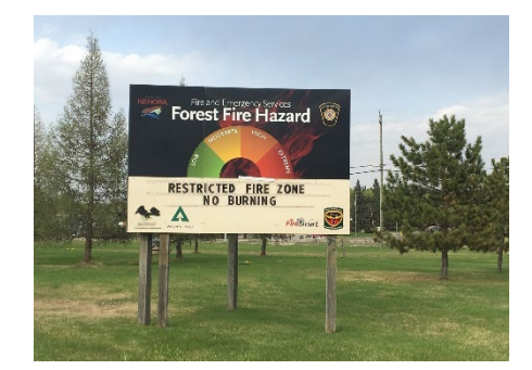
3 Forest Fire Hazard Sign