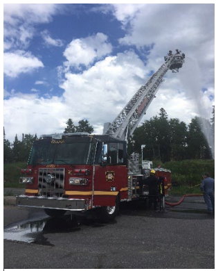
6 Ariel Platform Truck