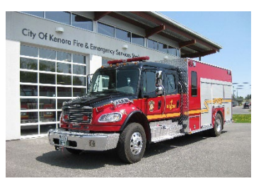
4 Rescue Fire Truck